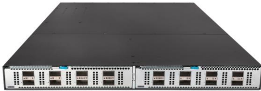
S6850-2C front panel

The switch provides 2 service slots, 2 × 100G QSFP28 ports.