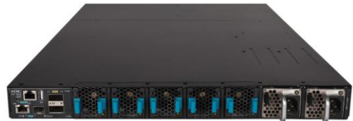
S6850-2C rear panel